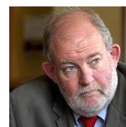
Rt Hon. Charles Clarke